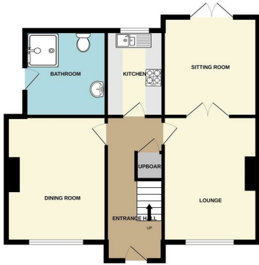
GROUND FLOOR 706 sq.ft. (65.6 sq.m.) approx.